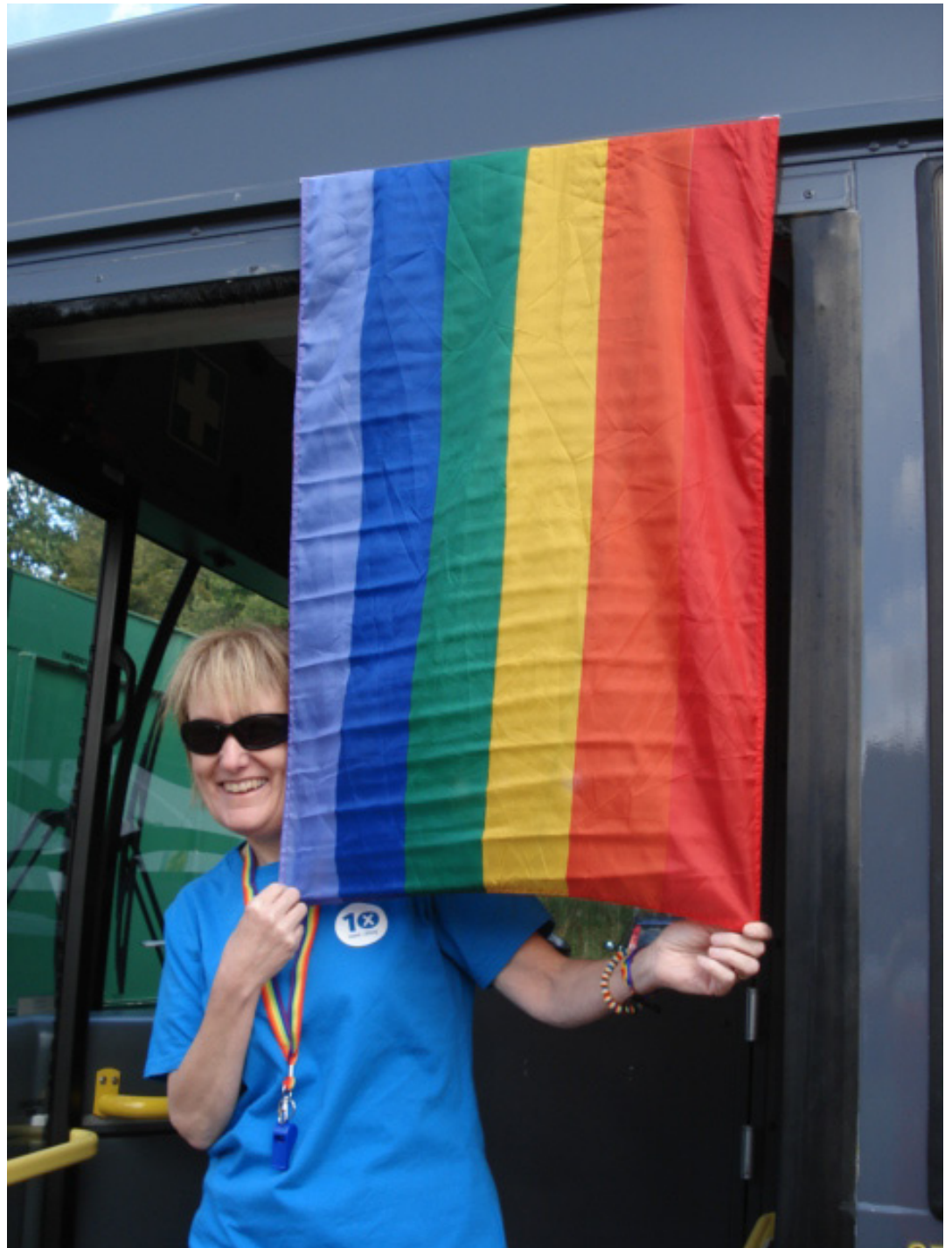
A member of our LGBT staff network on the Assembly Outreach Bus at the Cardiff-Wales Mardi Gras 2009

For the first time, the National Assembly was present at the Cardiff-Wales Mardi Gras. Staff from the Assembly's Events team, Equality and Access team and members of our LGB&T Staff Network were in attendance to welcome visitors onto our Outreach Bus, to inform them of the role and work of the Assembly and to explain what support is available to a lesbian, gay, bisexual or trans employee of the Assembly.