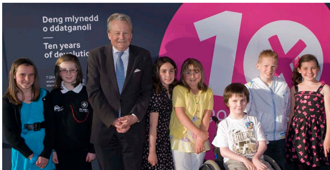
The Presiding Officer meets young people on 12 May 2009

To mark 10 years since the inaugural Plenary meeting of the National Assembly for Wales, children from across Wales born on 12 May 1999 were offered the opportunity to celebrate their birthdays in style at the Senedd. Children from Carmarthen, Neyland, Wrexham, Swansea, Cardiff, Newport and Tywyn joined Assembly Members past and present to mark this special day.