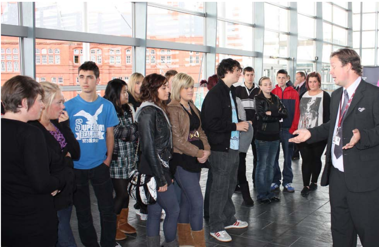
Staff at the National Assembly for Wales