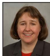
Lynne Neagle Torfaen